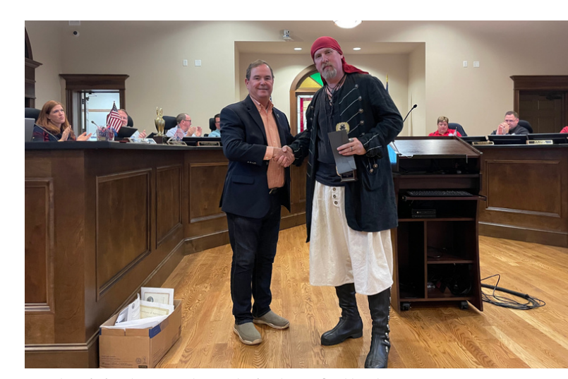
Most Original Nocturnal Pirates of Atlanta