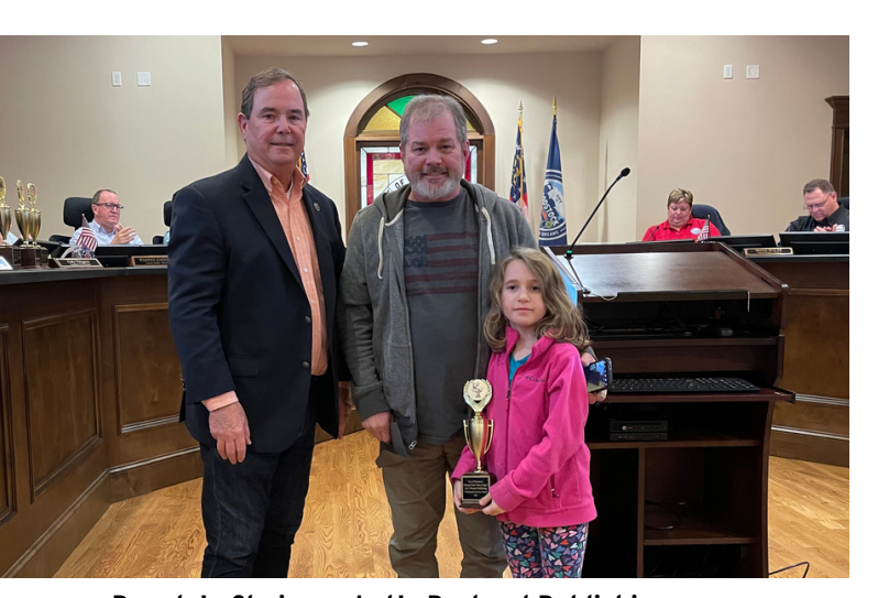
People's Choice Let's Pretend Publishing

Here are the parade float winners for 2021!