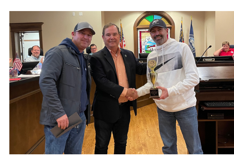
Best Holiday Power Taps Clogging