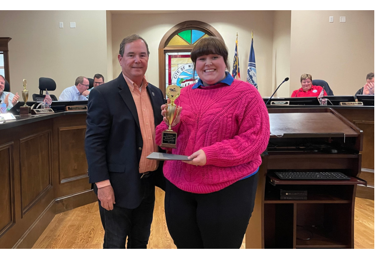
History & Heritage Bug Busters, Inc.